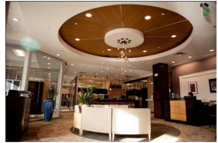
Flatirons Bank Boulder, Colorado