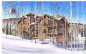
Tramontana Telluride, Colorado

Architectural Engineering Design Group, Inc. (AEDG) was founded on the basis of providing architectural engineering services that exceed the expectations of our clients. The core values of the firm's ownership group are to provide comprehensive, timely, and fluid coordination during a project's design process. These coordination efforts result in solid construction documents, reports, and recommendations that are clear and concise. AEDG provides more than engineered solutions; we provide a smooth, proactive coordination process all along the way.