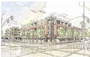
The Lofts at One Boulder Plaza Boulder, Colorado

The integration of architecture and lighting is a fundamental part of every design that AEDG is involved with. Education at one of the nation's leading lighting design programs, as well as experience on a wide variety of project types has given this firm the foundation to develop the appropriate solution for any facility and its anticipated uses.