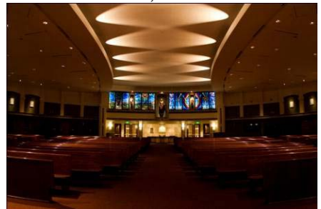
St. Thomas More Catholic Church Greenwood Village, Colorado